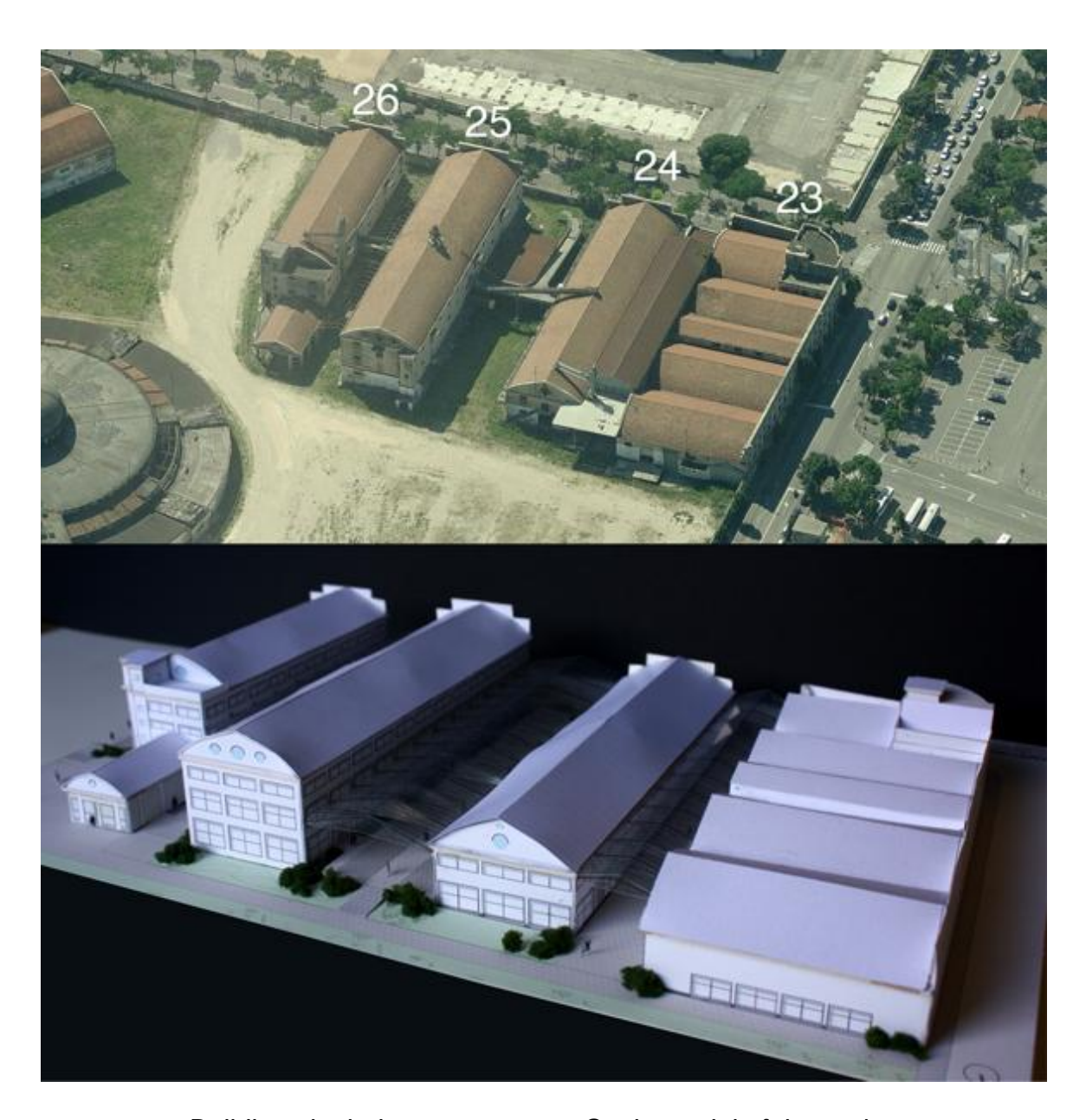
Buildings in their current state - Scale model of the project

In conclusion, the municipality's initiative of re-using the buildings is praiseworthy, but we must be careful not to fall back into the same situation we are trying to move away from, i.e. "monofunctional" or single-use zoning. Moreover, by introducing mixed uses the implied risk of the project is reallocated to a variety of players: if one player fails, his place will be taken by a new one. This mechanism cannot apply when only one actor is involved. In the long run, the mix of different uses provides a greater probability of success for the overall intervention project.