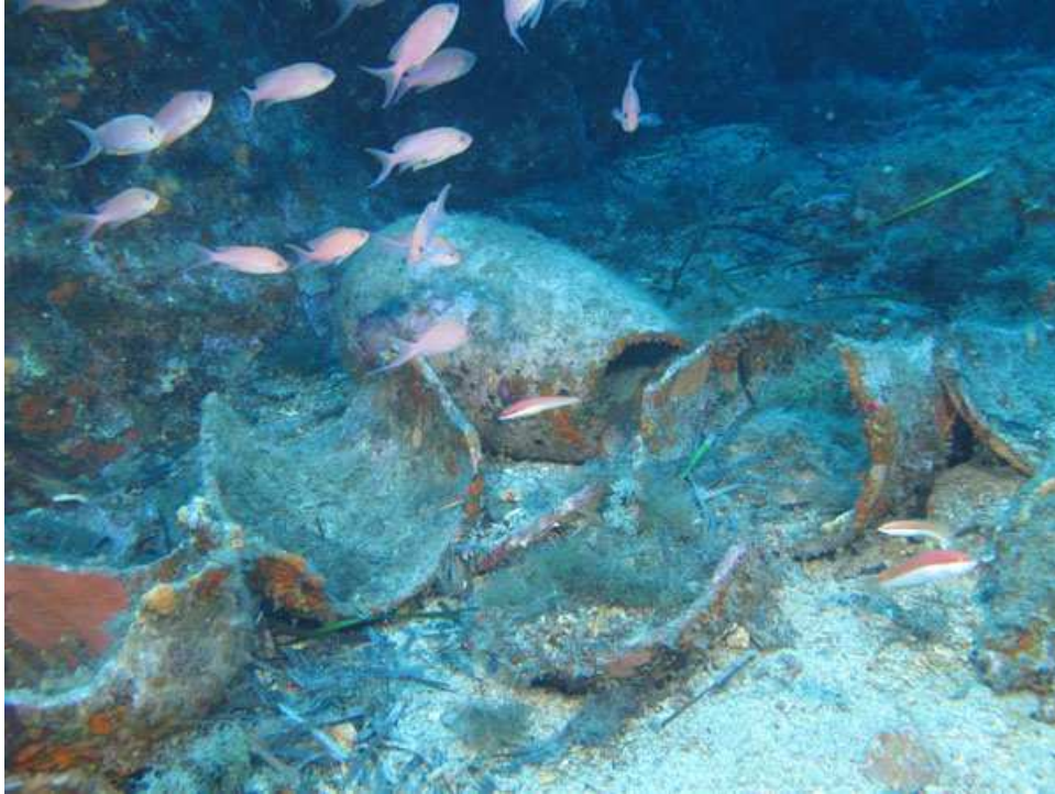
Amphorae situated in the archaeological site of Capo Graziano

The research has emphasized the connections and the similarities between the protection of the underwater archaeology and the terrestrial one, and also the peculiarities that make the submerged artifacts' conservation an innovative and contemporary topic.