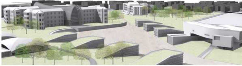
View of the project area

Around this space, several semi-underground pavilions complete the over all system.