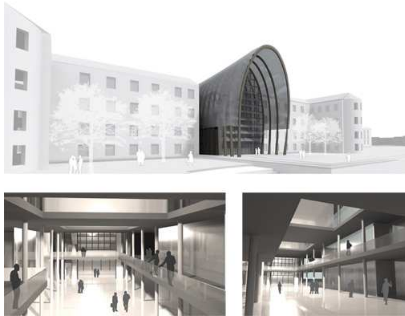
Views of the covered gallery

There, besides the discussion on the urban issues, it has been underlined the historical, cultural and social relevance of the building of the ancient hospital of Gorizia, despite the problems due to its scale and its low architectural value. My idea for its restoration is based on the placement of a new pedestrian gallery instead of the existing central volume. It is a space which at the urban scale connects the new park to the existing one, and at the architectural scale distributes all the functions placed in the building.