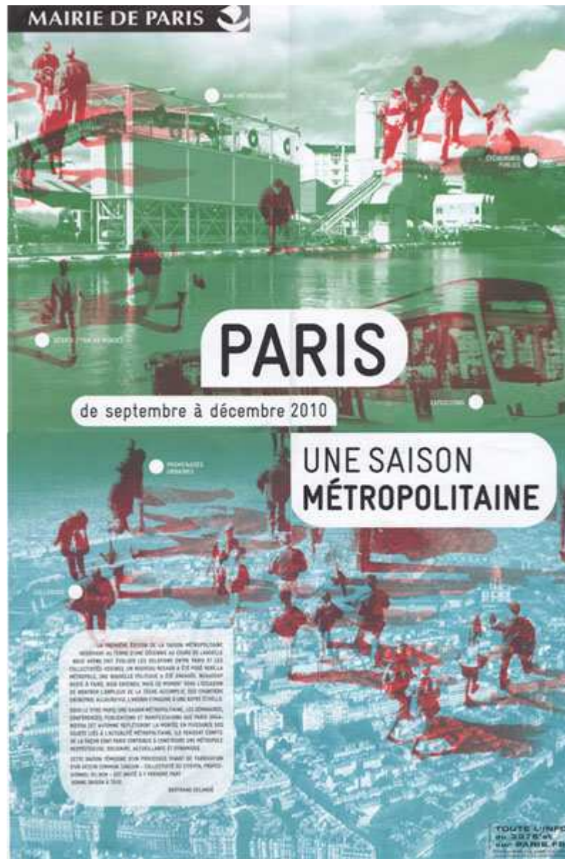
Poster of an initiative promoted by the city of Paris in the context of Paris Métropole . The consultation process is an element of a constellation of experiences

This kind of work wouldn't be impossible without a deep study of the Grand Paris paradigm evolution, from the will of territorial control to the creation of metropolitan identity (already started at the beginning of the XX century) and a study of the changes in the territorial projects practice related to the French technocratic tradition, in the research projects developed within the academic institutions and in the political and economical strategy promoted by the French government and the city administration.