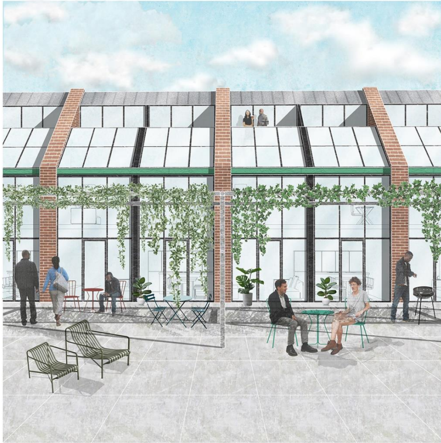
Project's new housing spaces