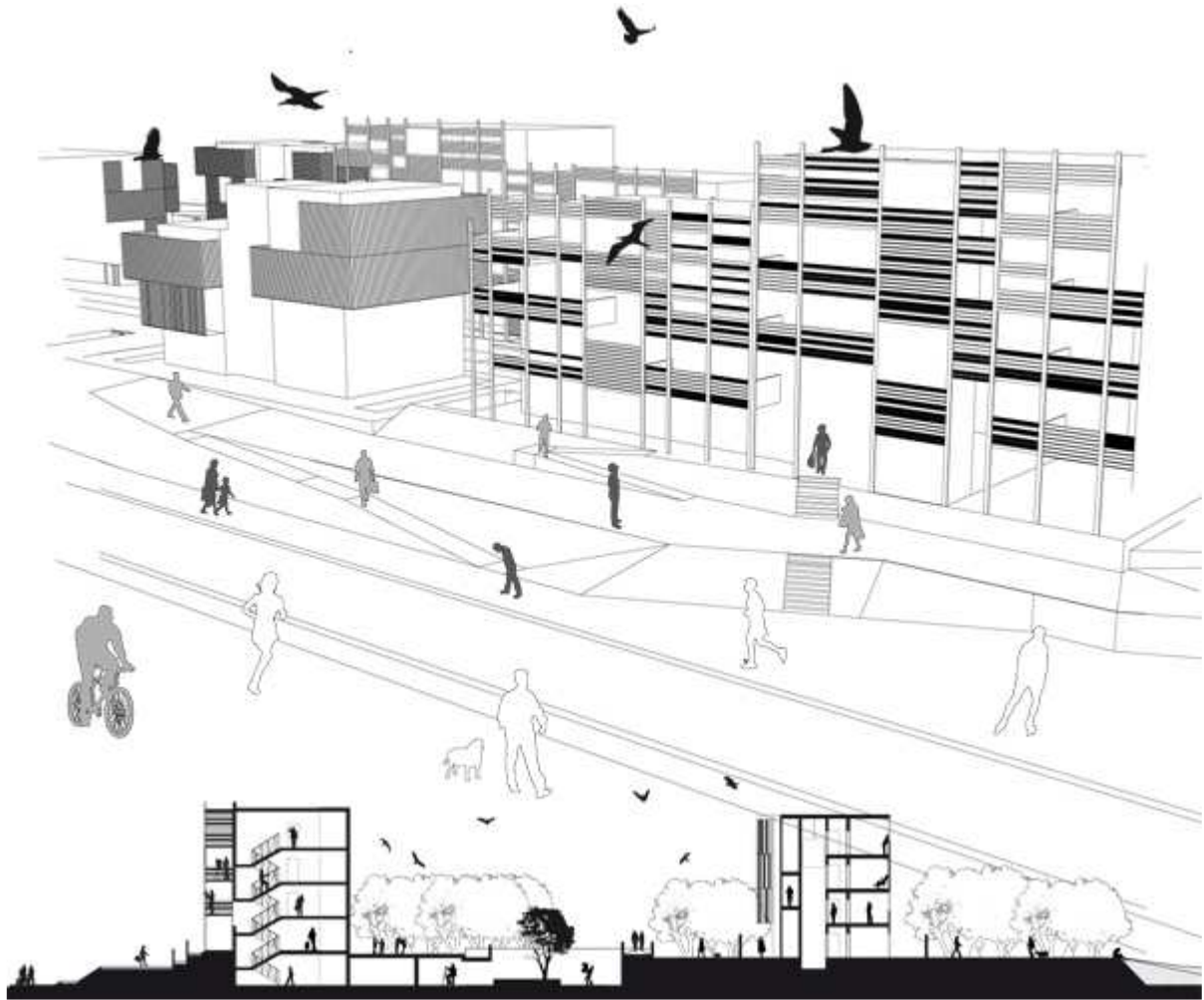
Section and perspective of a residential band