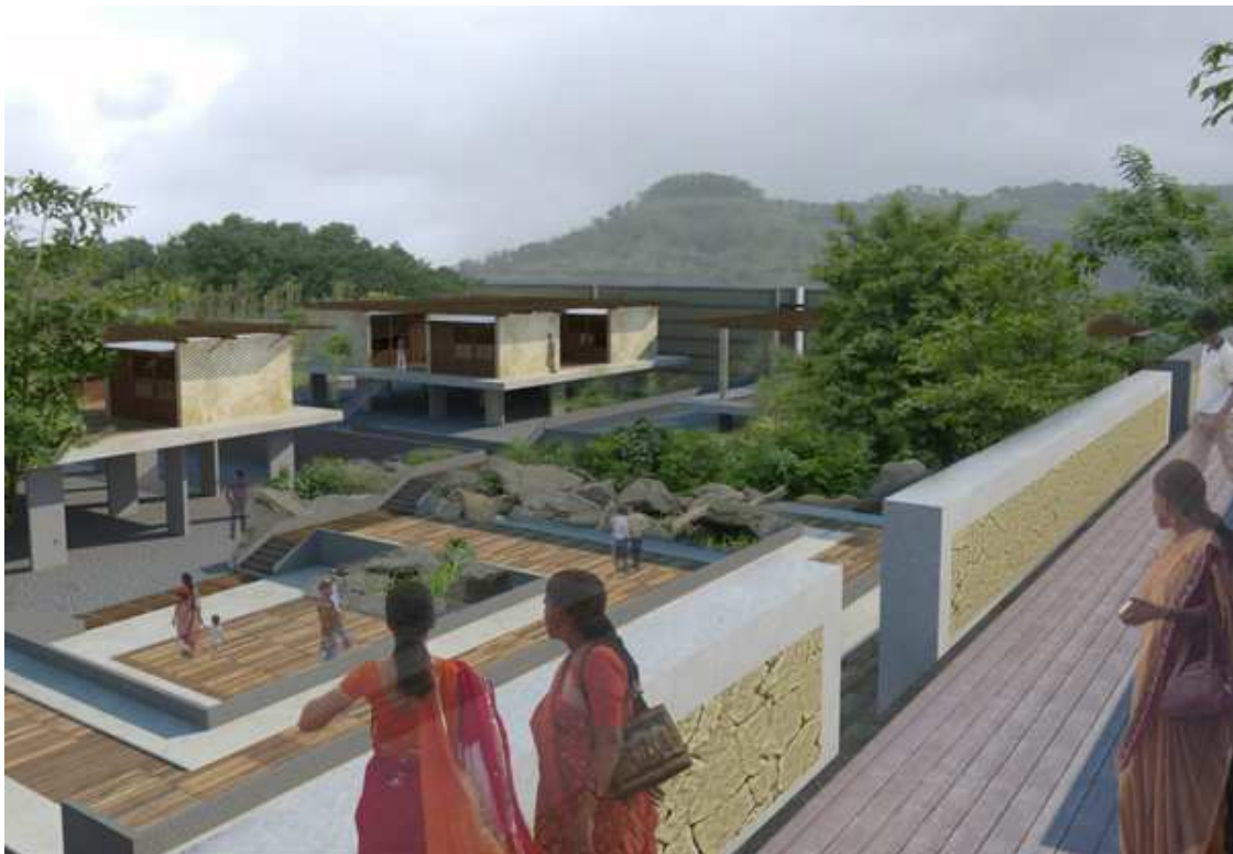
The walls in the centre which allow to reach every block at different levels