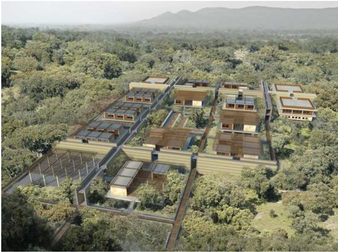
View of the centre with the different blocks