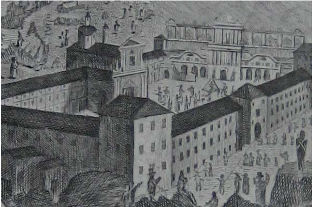
“The inner face of the Sanctuary during the Third Coronation” Billotti Pietro Antonio – Monatti Domenico Klemi, 1820-21

The goal of my research was to return also and above all immediately and visually communicative development over time of the Sanctuary. For this purpose I made use of "synthetic boards" that reproduce the entire work in graphical form through the use of colors and images. The thesis is structured into three main chapters: The Sanctuary of Oropa, the chapels of Sacro Monte of Oropa, the cemeteries of Oropa. For each chapter there is an internal division into paragraphs, which represent the internal periodization of the complex political and administrative reference. Each section is then divided into paragraphs that represent specific actions on the territory, buildings, edits, changes, and not for any period.