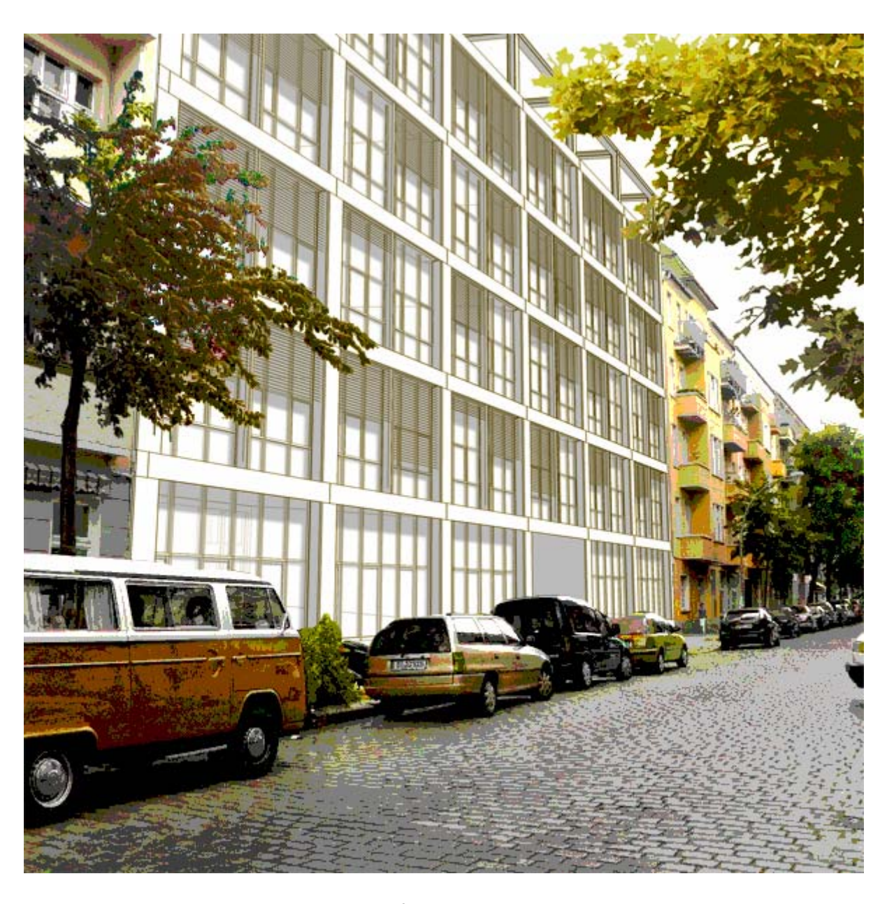
View from the street