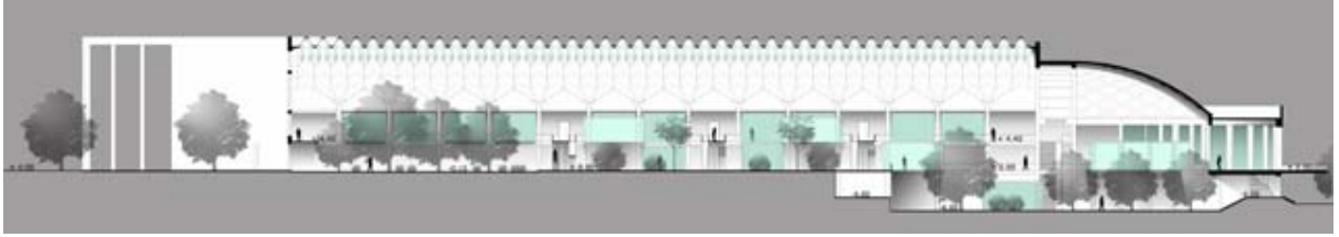
New School of Architecture – Longitudinal section on the Salone B. In evidence the green court and the emptying of the underground showroom

The removal of the covering of the semicircular underground showroom gave the opportunity to emphasize this role, obtaining a continuous section which simultaneously considers city, building and park.