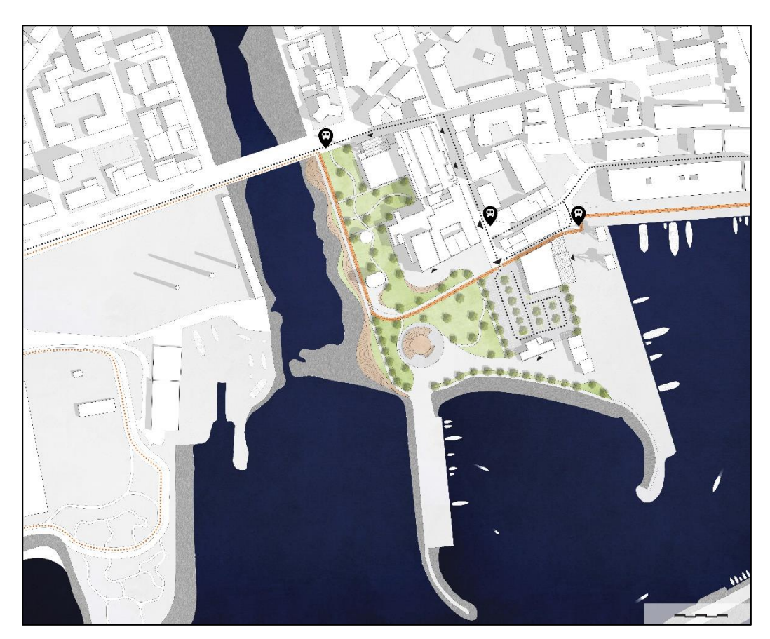
Immagine 2 – Masterplan project Agnesi