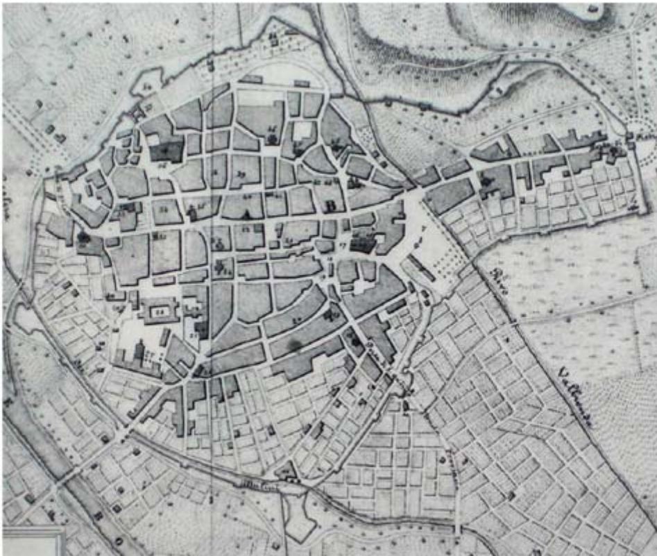
Map of Asti in 1839, Francesco Bologna

The present study approaches the evolution of the urban grid of the city of Asti, correlating the morphological aspects in each period. The aim of this report is to analyze historical processes relative to the transformations of the urban network, starting in 1815 and, throughout the century. Starting from the identification of relevant properties of road layout, using documents and historiographic and iconographic sources of Asti in strategic moments of its timeline, its spatial configuration is analyzed with space syntax methodology.