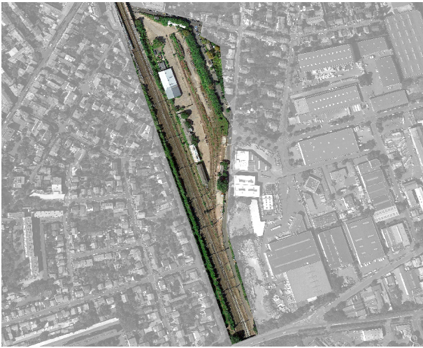
Image 2_ The Gare of Vitry sur Seine and the area of action subject of study

inside of urban design: in fact the rail line is like a barrier between different areas of the city and represent the fracture of continuity of the urban fabric of the territory.