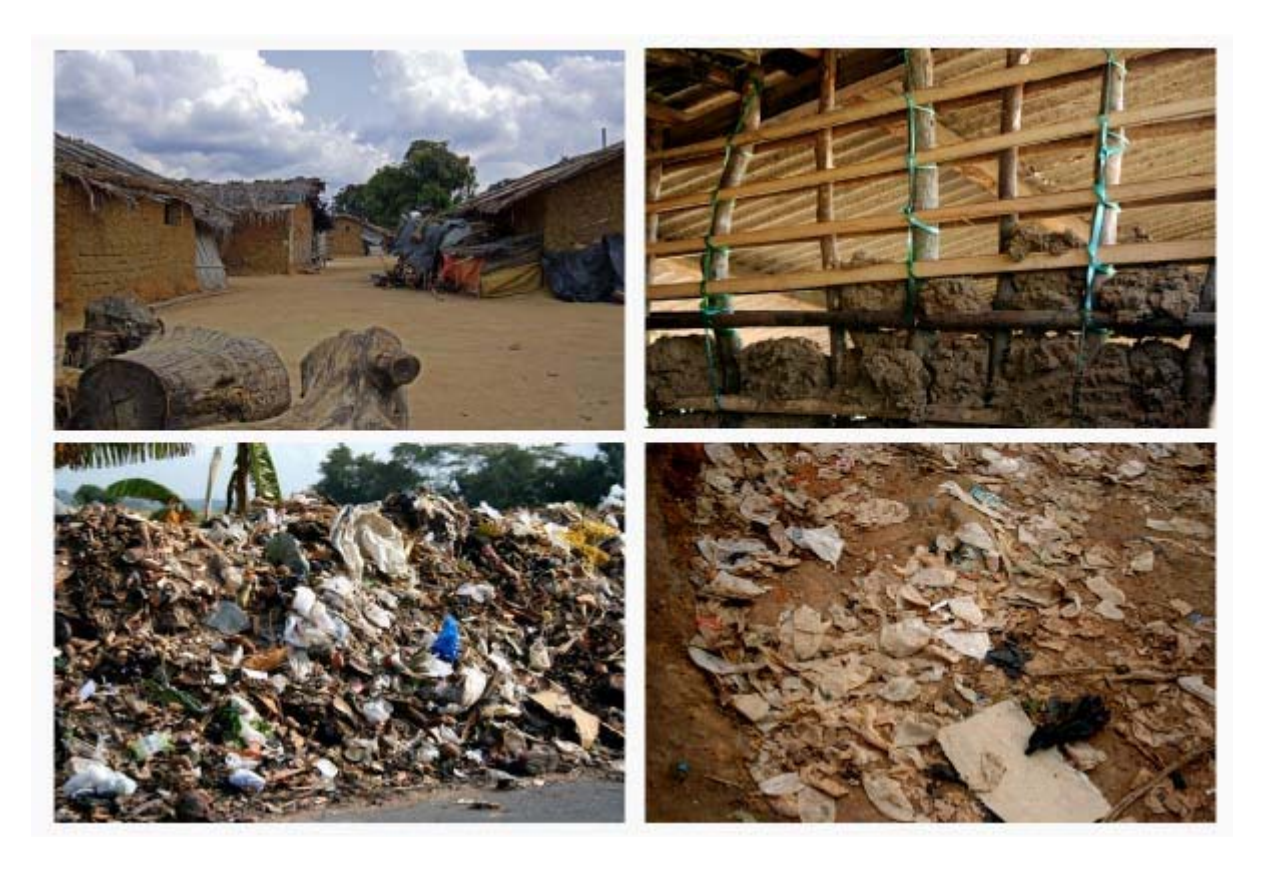
Traditional houses and the "flowers of Africa"

The idea of realizing a new moulded pressed brick has been one of the most significant targets of this research. They had to be economical, aesthetically appreciable, sustainable and easy to be assembled.