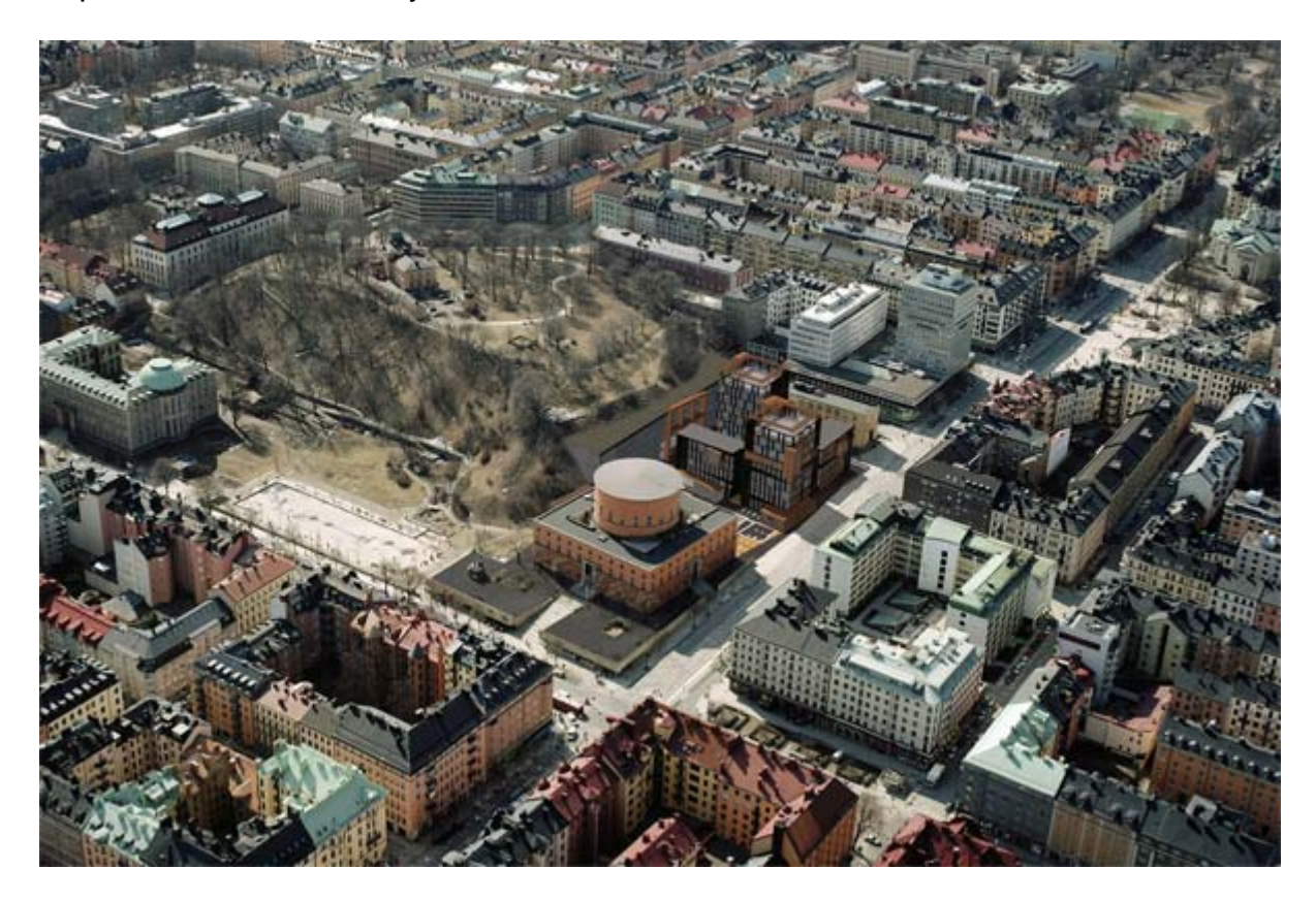
La Stockholms Stadsbibliotek: project

The project assumes the form of a new object inside an urban area that is very homogenous and with a strong historical background, built all in the same historical period and for this reason bounded by the same formal language of the Swedish Neoclassicism. These building are then consolidated in Stockholm's urbanism and they have very much importance for the municipality and for the citizens; this importance is reflected by the competition's text: international, made of proposals, open to all, it underlines the interests of the municipality to consider as many solution as possible, not necessary from well known architects.