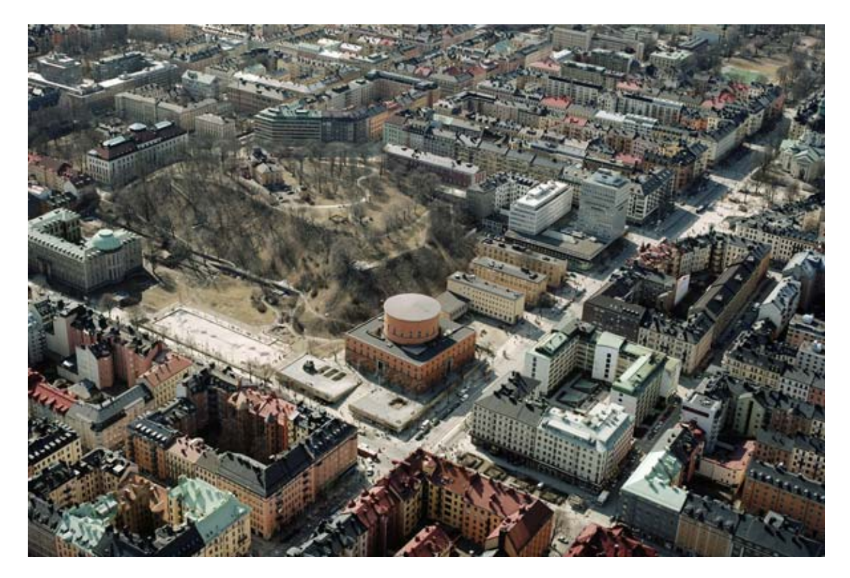
The Stockholms Stadsbibliotek: the present situation

Since the beginning the main problem has been to put into relation a monumental building such as the Stadsbibliotek with a contemporary building such as the expansion. The main issue to face during the drawings of the expansion, which was supposed to double the space of the Stadsbibliotek, has been to find a sort of dialogue with the Asplund's library, trying to propose coherent solutions, without being subdued with the monument but neither drawing shapes too much unrelated with the context.