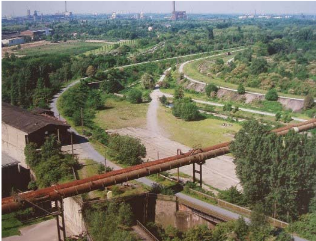
Landscape park Duisburg Nord, Duisburg