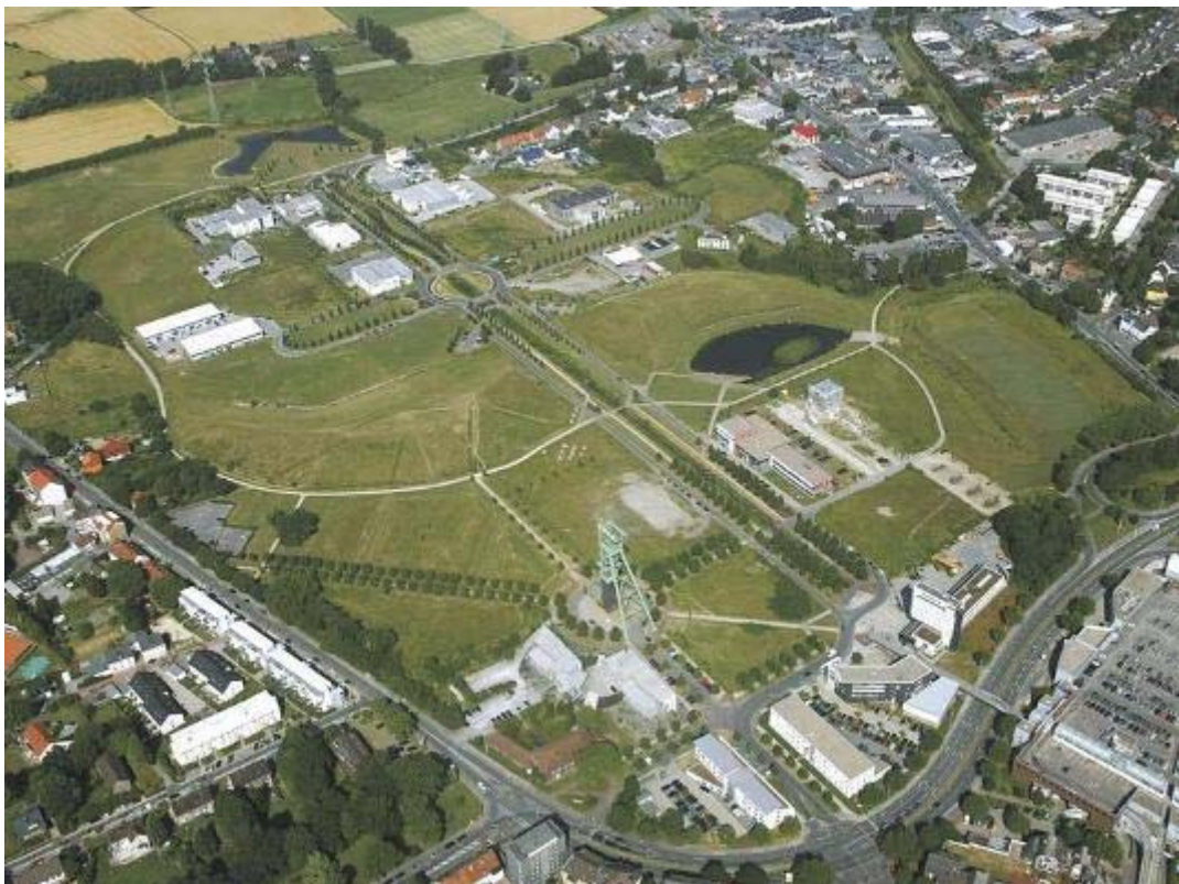
Industrial Park Erin, Castrop-Rauxel