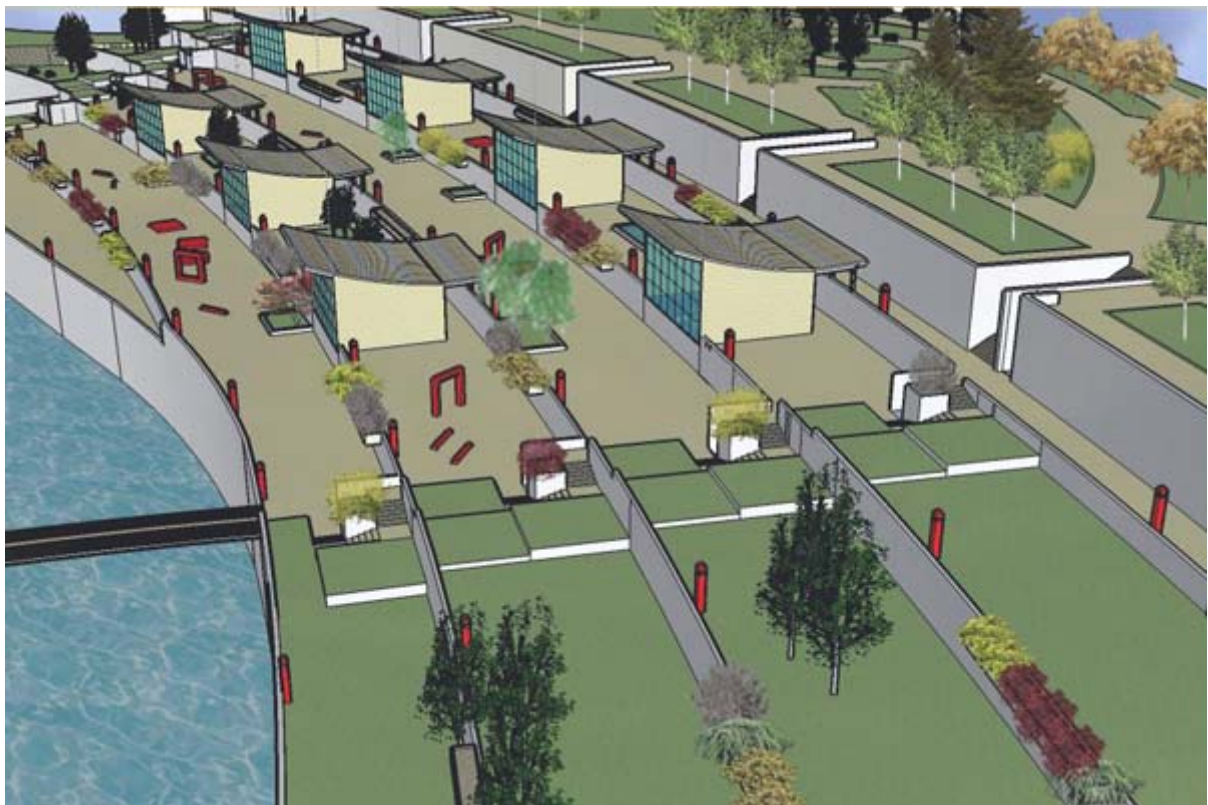
Total visual of the new multimedia center

To requalify the area occupied from the public gardens and the slope below realizing a public park that concurs to establish an interactive relationship between customers and place, donating a total image similar to that one of a great reticulum that, taking advantage of the particular orographic situation of the site, adages on the slope in declivity towards the Ellero torrent. Privileging the speech of pedestrian accessibility, the plan proposes of giving life to a several distance on levels, distributed on degrading terraces towards the Ellero torrent and connected by a staircases and lifts.