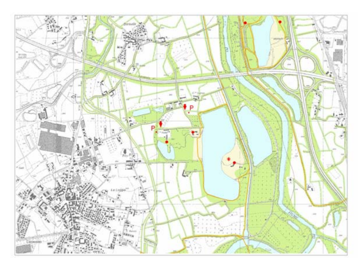
Project proposal for the Zucca e Pasta/SMAT quarry, given as an example for all the other quarries

The thesis has been mainly an analysis of the digging out activities of the region between Moncalieri and Carmagnola, from what I started for a new project. And so it has been organized in this way: in the first chapter of the first part is explained the management of areas by the Park Agency and the one called Area Plan.