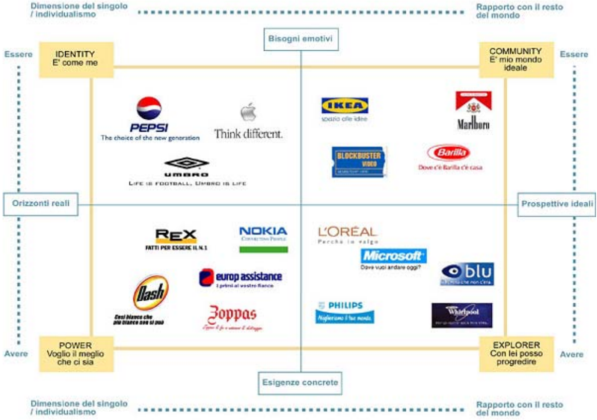
examples of trade marks, model by BGS D'arcy

Moreover, the architectural approach could become even more important in order to consider the "construction of a reality" as one process, where it's possible to use indistinctly physical and virtual elements as bricks. To do that, you should be deeply connected to the WHOLE process of communication and draw your inspiring lines from it.