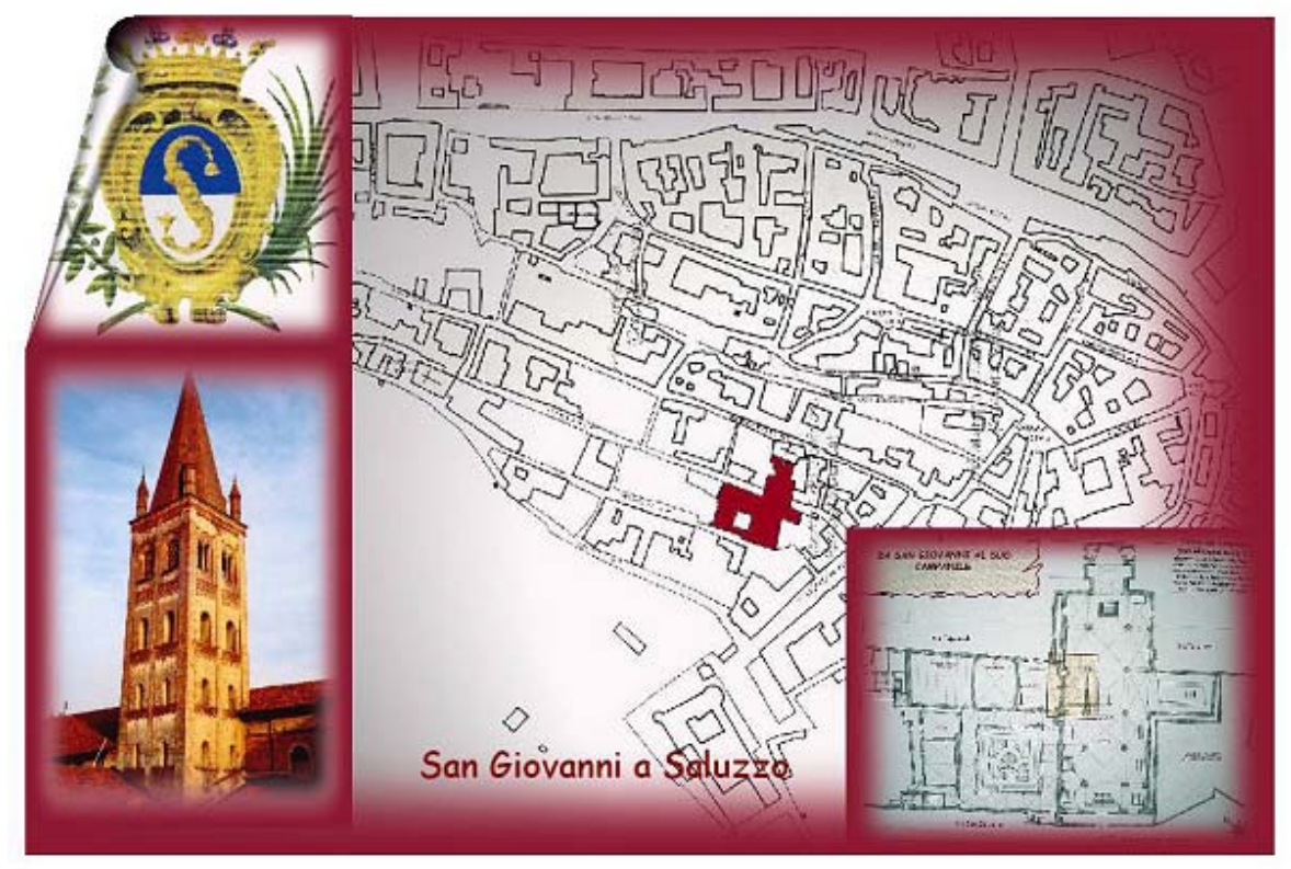
The bell tower in the San Giovanni complex.

The bell tower is the most significant in the panorama of Saluzzo not only because it is one of the oldest, but also because it is interesting from an architectonic point of view. It is part of a church-and-friary complex built on a pre-existing structure by Frederic II in 1376. A golden bronze cockerel, today replaced by a copy, was put at its top as a symbol of the French protection which the marquisate benefited from.