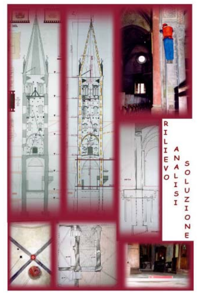
Studies and suggestions: survey, analysis of the instability and a possible solution to the thinness.

While looking for the documentation concerning the complex, it was found that the stability of the tower had already been a matter of discussion in some documents written in 1869, following the survey of the engineers Ferrari and Ferrante. By restoring the bell tower, the cultural and architectural value of the monument would be increased. For this reason, a study of the actual state of dilapidation and instability was carried out. The instability problem was analyzed in depth in order to put forward two hypotheses for the consolidation of the tower. If the first suggested intervention would prove to be insufficient to guarantee the stability of the bell tower, it would be necessary to carry out the more invasive, though more effective one.