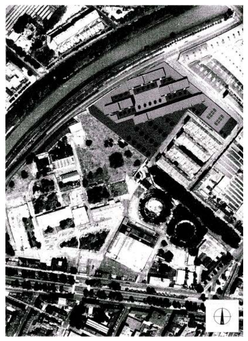
Aerial Photo Showing the Roof Covering Plan

We referred to the contingent claims analysis and to Cox's, Ross's and Rubinstein's exponential model, which are instruments that allowed the management flexibility to be considered by patterning uncertainty. For example, two different options were suggested: the alternative no-risk investment and the change in architectural allocation of the project. These options allowed the theory to be applied and a duly tested model to be built. This model could be included among the decision-making criteria supporting the traditional discounted cash-flow analysis.