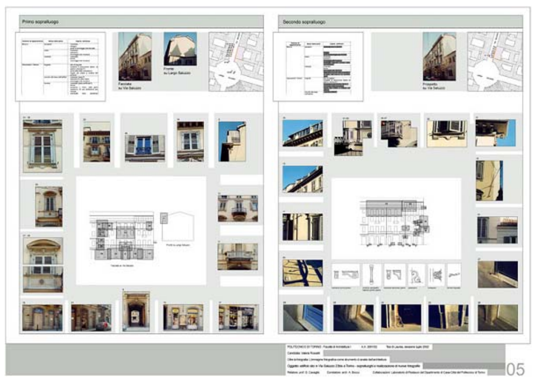
im02: photographic surveying on a building in Turin

In conclusion, the thesis invites to pick the possibilities of knowledge and surveying which the photographic instrument offers and to recognize the extraordinary documentary role that photographies carry out.