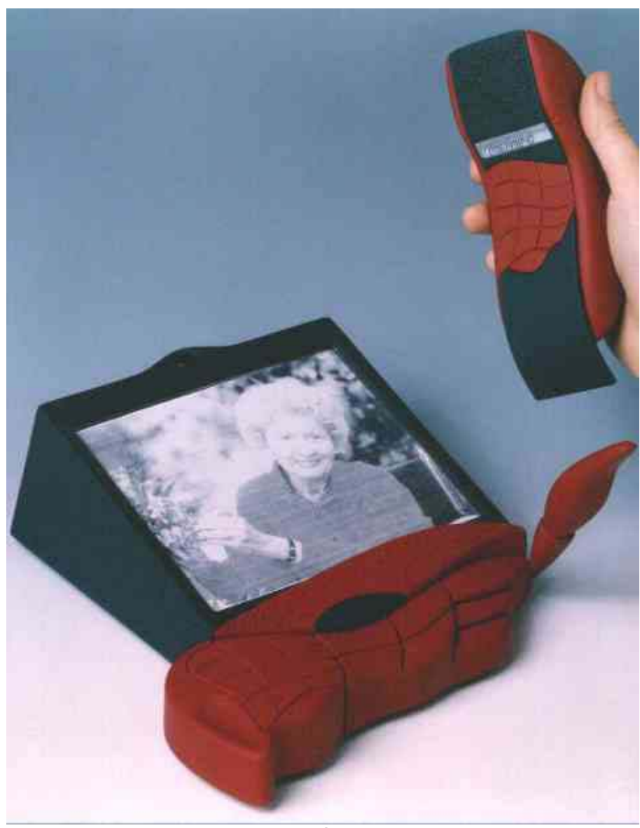
The Internet Screenphone

The chromatical difference between the components emphasizes the presence of a rigid structure, tied to production standards, quite different from more sinuous parts in contact with man; the most flexible and ergonomical part is attached like "alien" to the anonymous geometrical part in a symbiotic penetration.