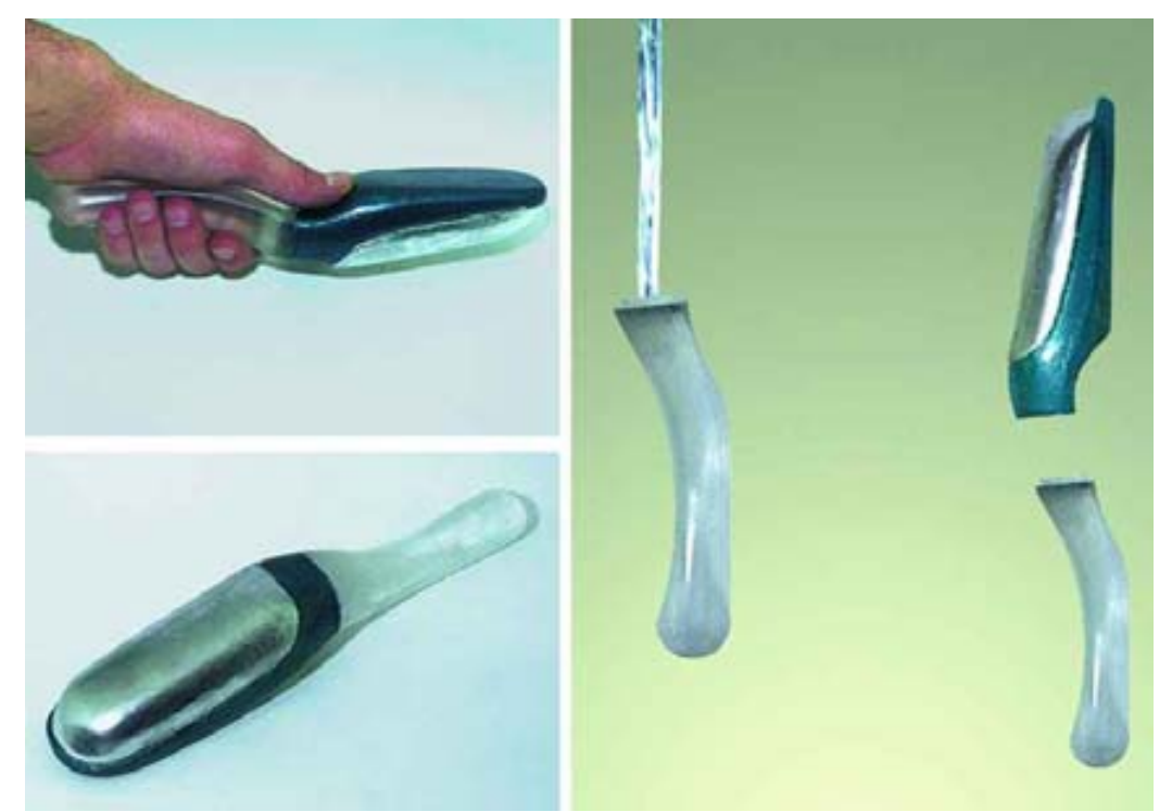
The iron: the handle, laid on its back, water-tank filling

The plastic handle is transparent and can be pulled out to be filled with water before being screwed to its main body again. Because of the small dimensions of the watertank, water must be added every fifteen minutes. The water-tank is illuminated from inside by a luminous led which indicates the battery feeding level and also allows to check visually the quantity of water present inside.