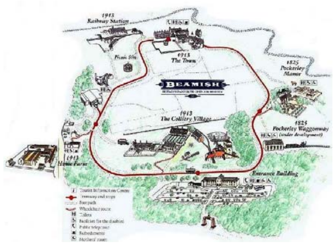
Museum Open Air , Beamish , The guide of Beamish , Jarrold Publishing, Beamish, 1998

However, the spontaneity and original authenticity of the concept of the EcoMuseum was modified and adapted to the specific historical and social situations of the nations involved. We have to remember that in some Northern European countries (for example Sweden, Norway and Denmark) folklore museums and demo-ethno-anthropological museums were already developing at the end of the 19th century, when the industrial revolution began to eclipse the traditions, beliefs and objects associated with farming culture. In Great Britain it was never really necessary to recur to the term EcoMuseum in order to describe territorial museums extending over vast areas; in fact, they were defined as "open-air museums". Buildings were brought to a given area and re-built according to an ideal format, the fulcrum of which was the visitor, who had to be totally immersed in the atmosphere of the period represented. This sort of museum is often known as "village museum" and consists of a series of sites grouped together in such a way that an environment with a highly historicized context is provided. Museums of this type were created at Beamish and at Ironbridge.