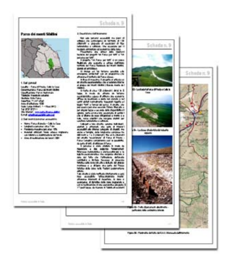
Example of riassuntive cards

Park of the Orecchiella covered accessible to the motor disabili - deep grassy improved with stabilization of the bottom. Each "accessible" natural area is on file, with short one description of the specific intervention.