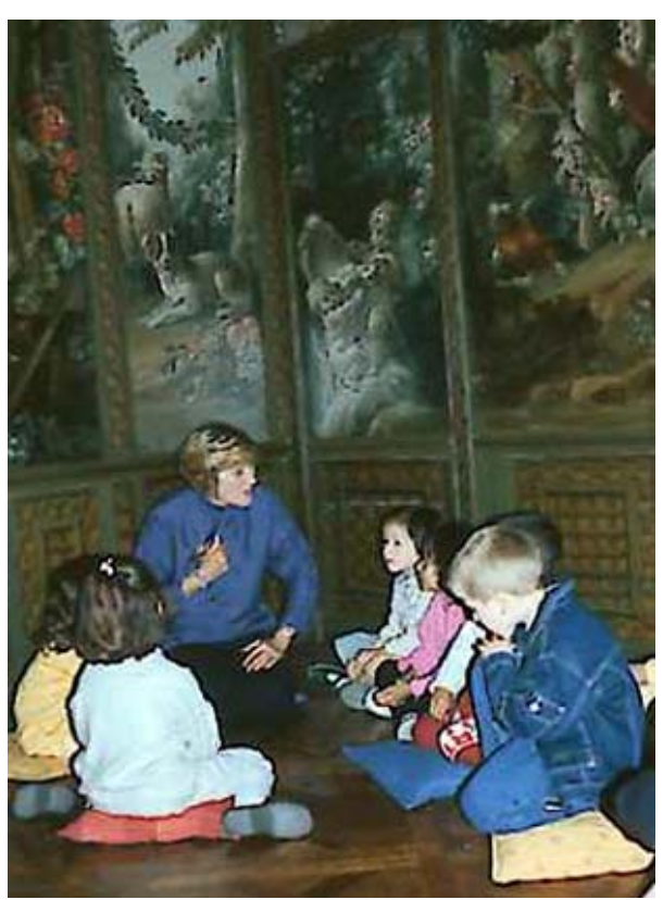
Picture 2: learning activities for children in a city museum

An analysis of the different activities of the museum has shown that the museum should create contacts and connections with external entities: the "monuments" of the city; the cultural institutions in the city, especially its schools and universities (picture 2); and other city museums, with which it can create museum networks, becoming in this way an important node and pole of coordination.