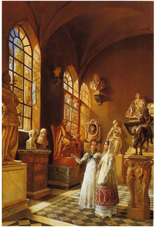
Picture 1: the Museum of French Monuments, an antecedent to the city museum

According to the definition by ICOM, the International Council of Museums, a city museum can be defined as a centre of a co-ordinated movement whose objective is to represent the culture of a city population by means of: celebrating a common identity, researching its roots, valuing its various communities, identifying resources for carrying out activities for cultural development in the community; and instituting a co-ordination centre for the safeguarding and communication of cultural activities, past and present, of the community. The city museum is an institution which originated in the nineteenth century, although it is possible to establish antecedents both more remote and more recent (Picture 1).