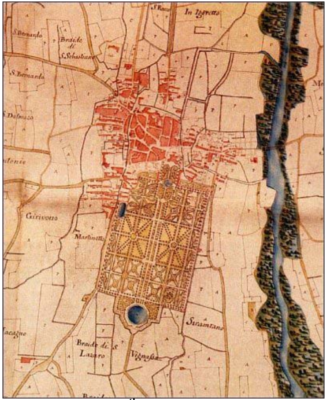
2. The 13<sup>th</sup> century city map (A.S.T., Ministero delle Finanze, Tipi sez. Il n. 381)

The thesis goes on to study the township of Racconigi. An analysis is made of its historical development through the use and illustration of the most important city maps throughout the ages. The study begins with the most ancient ones (image no.2), which date from the 13th century and goes up to the 1813 plan belonging to the French land public registry introduced during the Napoleonic period.