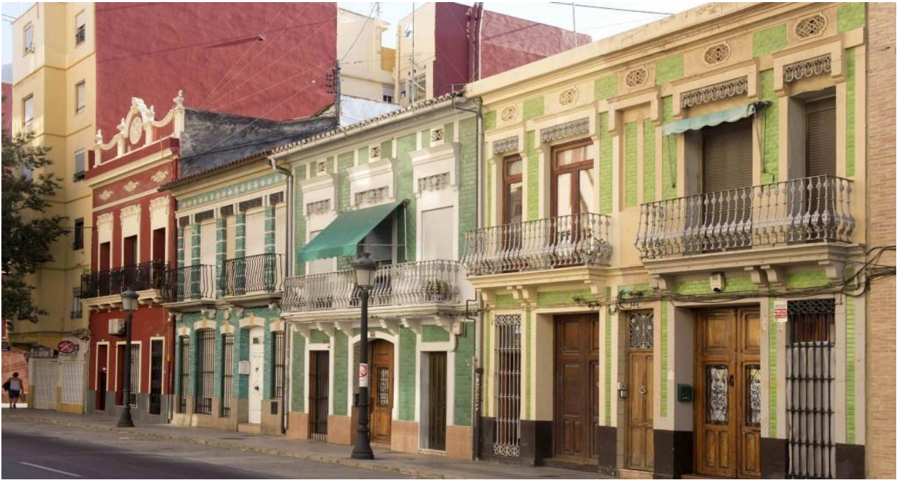
Buildings in Carrer de la Reina, Cabanyal

The thesis is proposed to investigate some practical aspects related to the industrial archeology and restoration, focusing on some of the most interesting and emblematic neighborhoods of the city of Valencia (Spain): Cabanyal , Canyamelar and Cap de França .