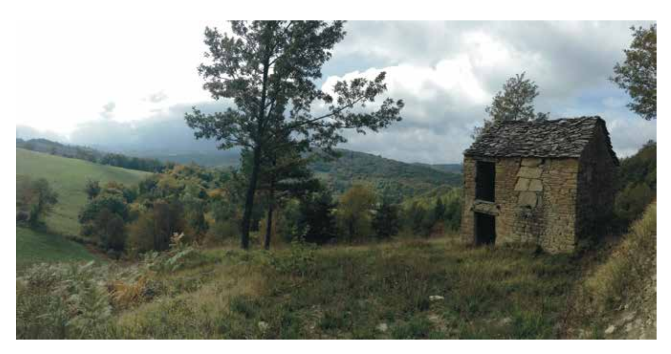
Fig. 1 Ciabòt / valley view

The intervention respects the environment preserving what already exists as well as the local background; it lightly integrates itself in the existing reality through minimum operations that show how it is easier and more sustainable for the human being to adapt to the environment rather than the opposite. The ciabot remains a shelter in which the light is given by candles, the water by rainfalls and the heat by fire, witness of a past to be appreciated.