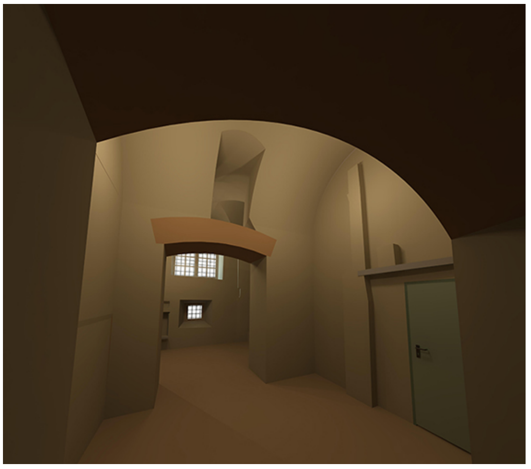
Figure 2: Locals modeled with Revit Architecture

Using these two-dimensional elaborate, to rebuild with Revit elements of the detected environments were adopted modeling techniques making simplifications to created objects, taking into account the limitations in the program in terms of modeling of complex elements and looking for solutions that make it possible to obtain a result closer to the original shape of the elements; these simplifications have not however compromise the conformation of the premises or of individual items, but simply allowed to be as realistic as possible.