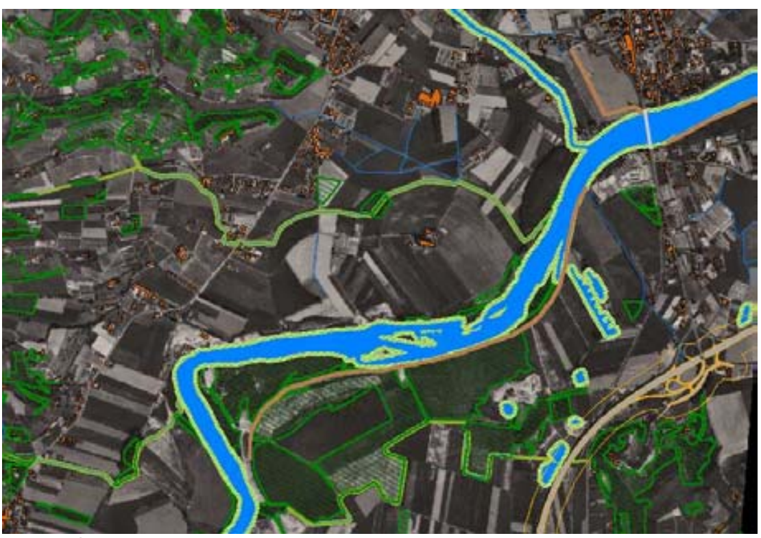
Overlay of informational levels – Aerial photograph and vector data