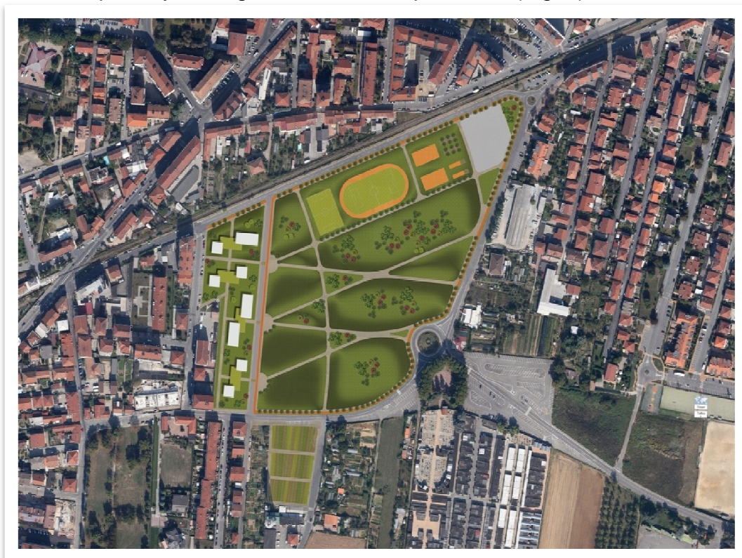
Figure 3 - Project for a new urban district

The structure of the scheme of isolates is in order to the change typological elements, functions and dialogue with the existing. It is treated the relationship between the effects of fragmentation and segmentation of the urban fabric so as to limit marginalization. In conclusion, the idea of the project adheres as closely as possible to the requirements of the Urban Renewal variant PRG, maintaining the uses and the volumes required for residences. Moreover, it was extended an axis driveway, via San Giovanni on the entrance area leading to the residences, identifying clearly the residential area from the City Park. This clear separation is the goal I set myself, for design purposes, so that each intended use is distinct, especially among residences and park area (Fig. 3).