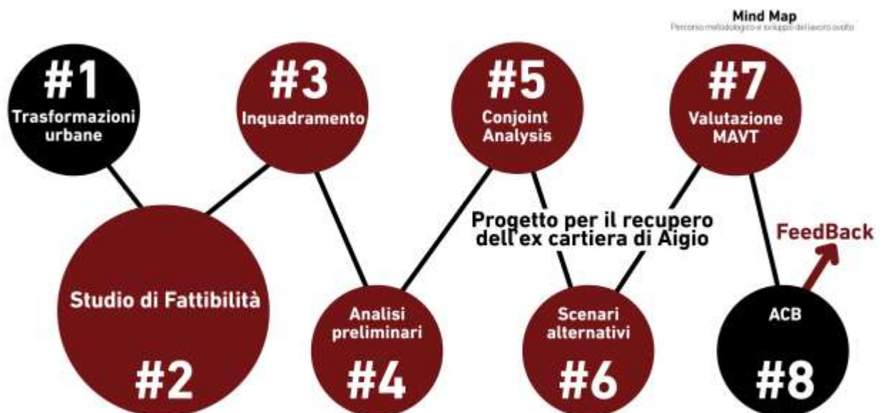
(Figure 1_ Mind Map )

Through the preliminary analysis (SWOT, Stakeholders analysis) regarding the socio-economic context and the urban place, three projects were created for the abandoned spaces. The proposed interventions also stem from a process of public participation, as