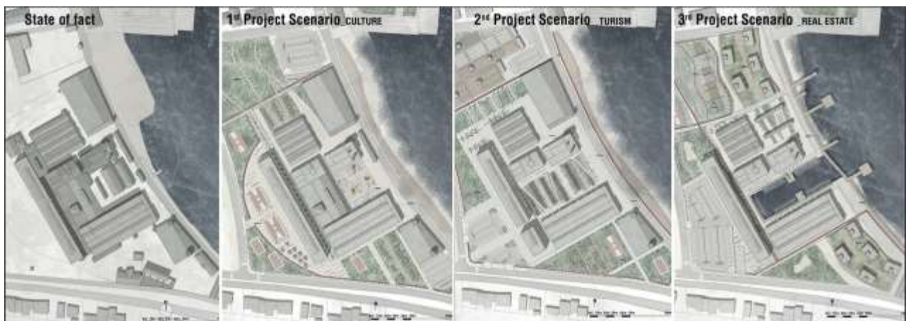
(Figure 3_State of fact and Design Scenarios)

The three scenarios have different morphologies and functional programs, responding to the needs of the place. The highlight of the study was the evaluation of the scenarios through the multi-criteria approach MAVT trying to list the performance of the projects based on various attributes considered through their weighing performed by various experts.