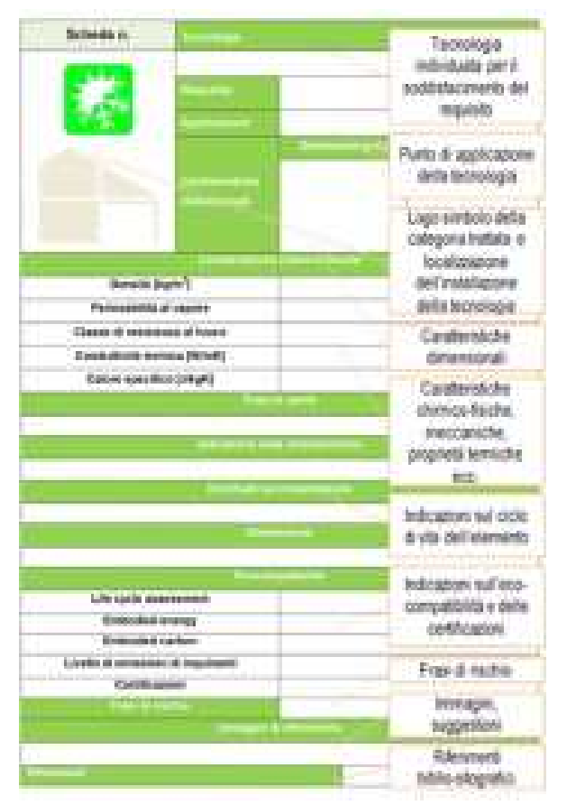
Example of tecnological boards

that can be a good starting point for the development of a technological concrete project.