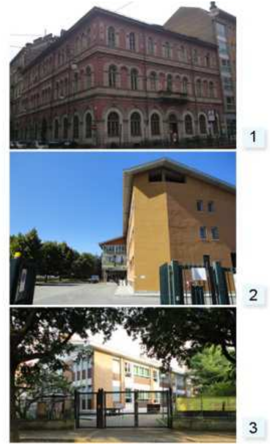
The three school buildings in Turin (1. Junior high school "Lorenzo il Magnifico", 2. Primary school "F. Parri", 3. Primary school "R. Dal Piaz")

In this context, we can find the project Pro_Lite ; an European initiative, introduced in the program Torino Smart City , which complements the innovative technological project aimed at sustainability with the project of comfort and psycho-perceptual comfort of scholastic user. My research has led to the identification of three design solutions meeting the latest regulations and international projects mentioned above in order to redevelop one of the three school buildings in Turin concerned by the European project: the primary school Riccardo Dal Piaz .