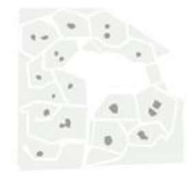
The open space and the rest areas