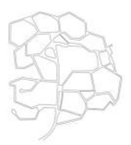
The moving space by car