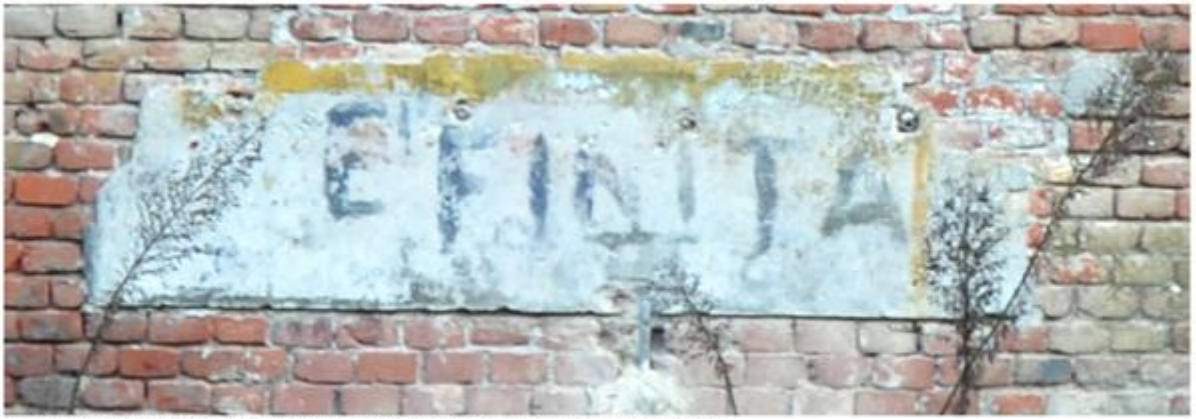
Image 2: Written in the south front of the Powder Magazine St. Thomas.

In 1949, the writer Giovannino Guareschi<sup>1</sup> noticed the word "Run!" on the wall of a building, together with the dynamic nature of the Citadel: his words resonate today absurd and linked to another time and another place. Today, on the south front of the Powder Magazine St. Thomas, in the only piece of plaster still intact, appears a written quite different, which states: "It's over" (image 2).