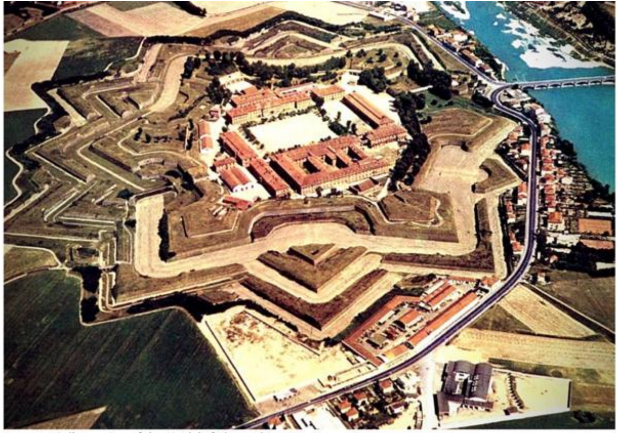
Image 1: Bird's eye view of the Citadel of Alessandria.

The Citadel of Alessandria (image 1), in all its complexity, is an interesting insight on the topic of valorisation and management of state property in Italy.