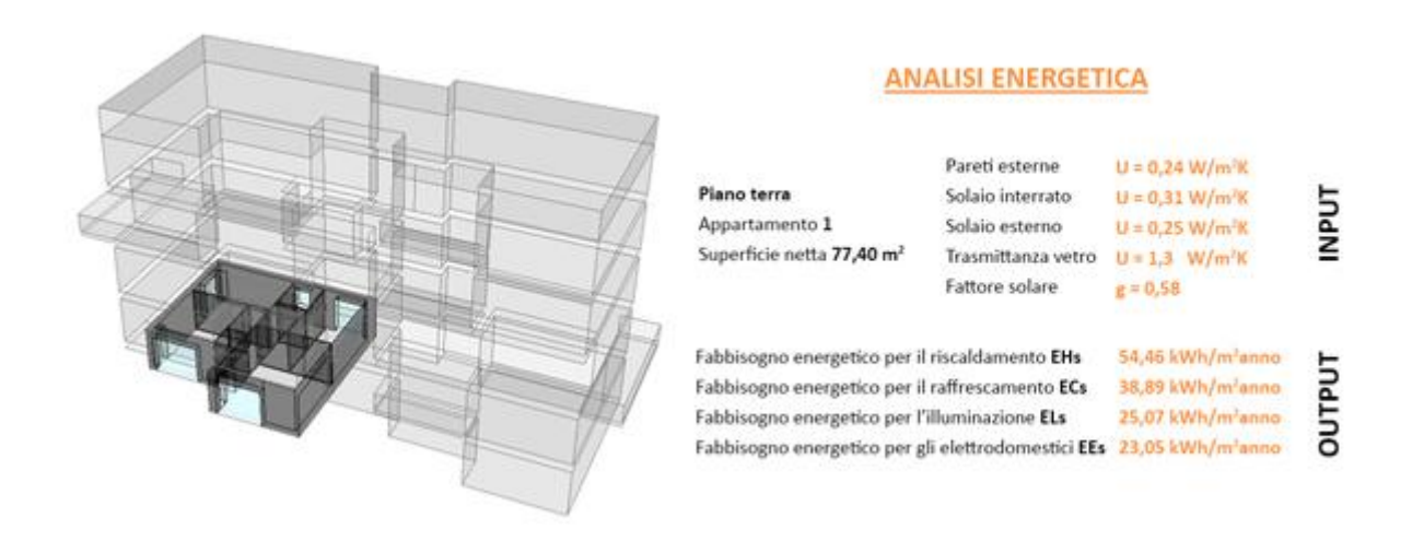
Example of energetic analysis

In order to test the Tool skills, a set of simulations have been carried out on a fivestorey building project consisting of ten apartments. The apartment plans were different for each floor, changing spaces such as corridors, storage rooms and bathroom, in order to expand the number of case studies and to evaluate the versatility of the Tool in heterogeneous conditions. The building's volume is articulated by terraces and protruding/falling volume in order to test tool skills to shape a three-dimensional building model.