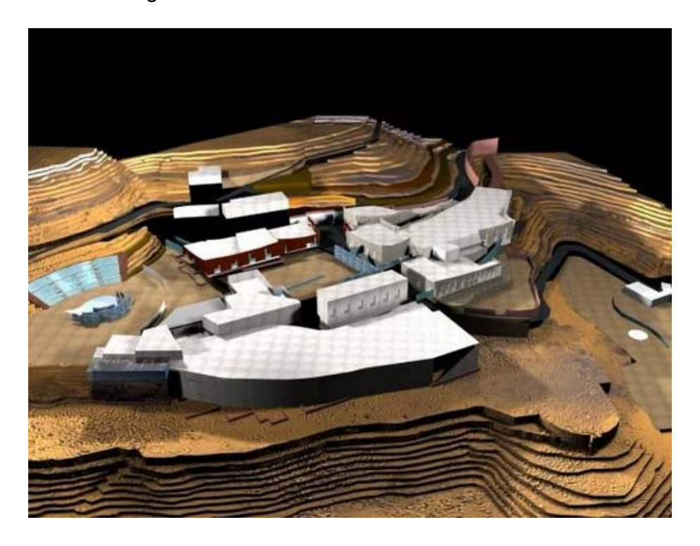
General view of the complex

The aim of the project is give a new shape and use to the building complex which originally housed the activities for the supply of tools and plant to the primary mining activity and the working of the minerals.