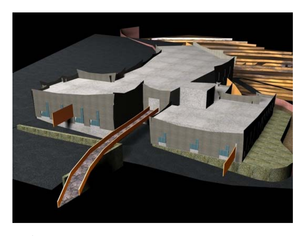
View of the television studies with the iron nets and L-shaped windows

The proposed intervention is aimed at a radical re-layout of the existing complex, which is on the other hand conditioned by an advanced state of decay, and at offering innovative solutions that seem to be compatible with the framework and with the recovery works of other buildings, included once again in the same context and recently earmarked as university buildings or logistic solutions suitable for hosting cultural events, conferences and exhibitions.