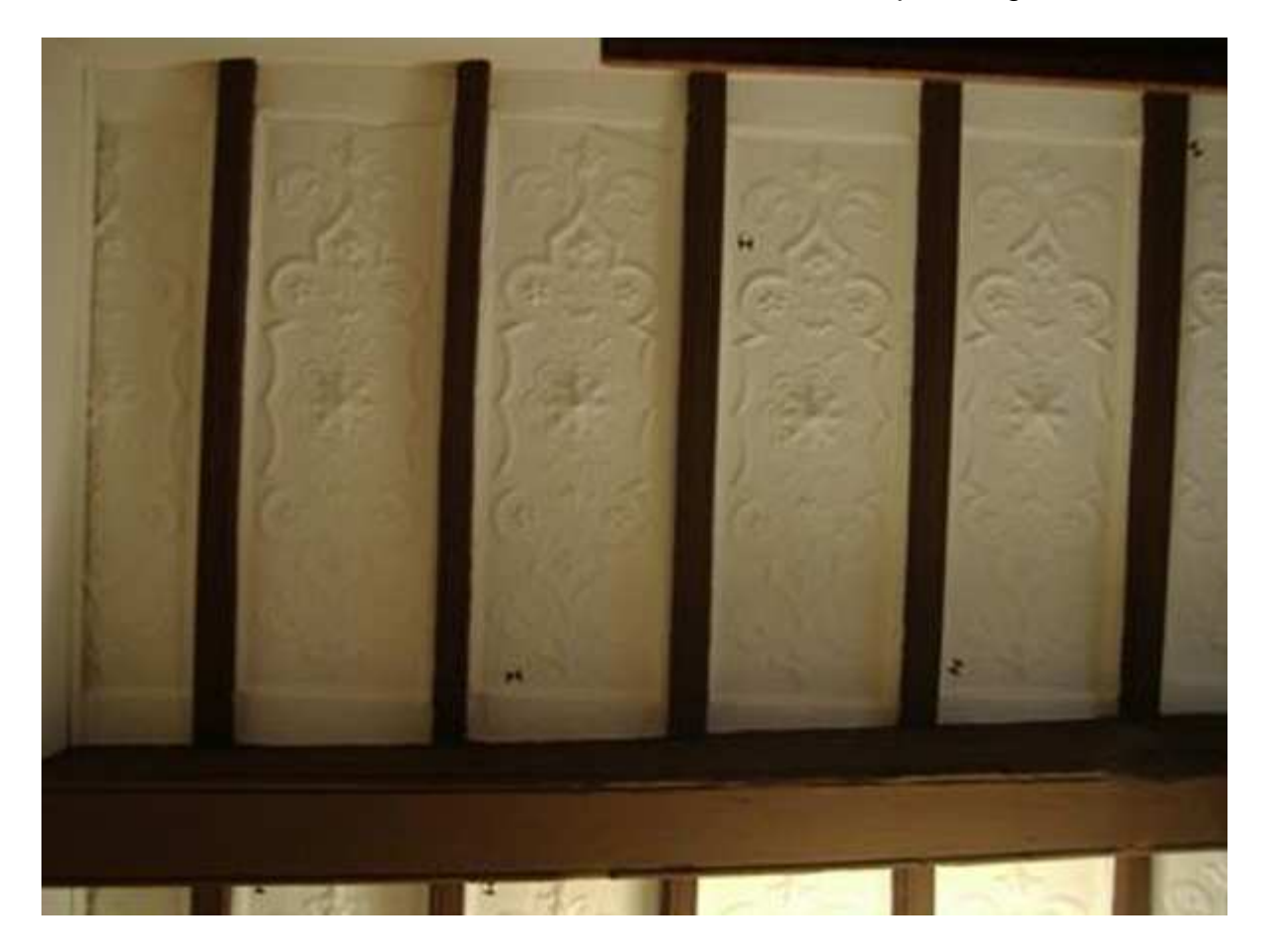
Gypsum ceiling photographed in a private home in Bagnasco (Montafia)

The research is developed in the study of some decorations of the gypsum ceilings of Monferrato, this is a particular building system documented from the end of the sixteenth century until the end of the nineteenth century, that replaces the wooden planking lean on beam warping with a gypsum jetty. The great ornamental effect embellished the interiors of homes which conceded a few simple design solutions.