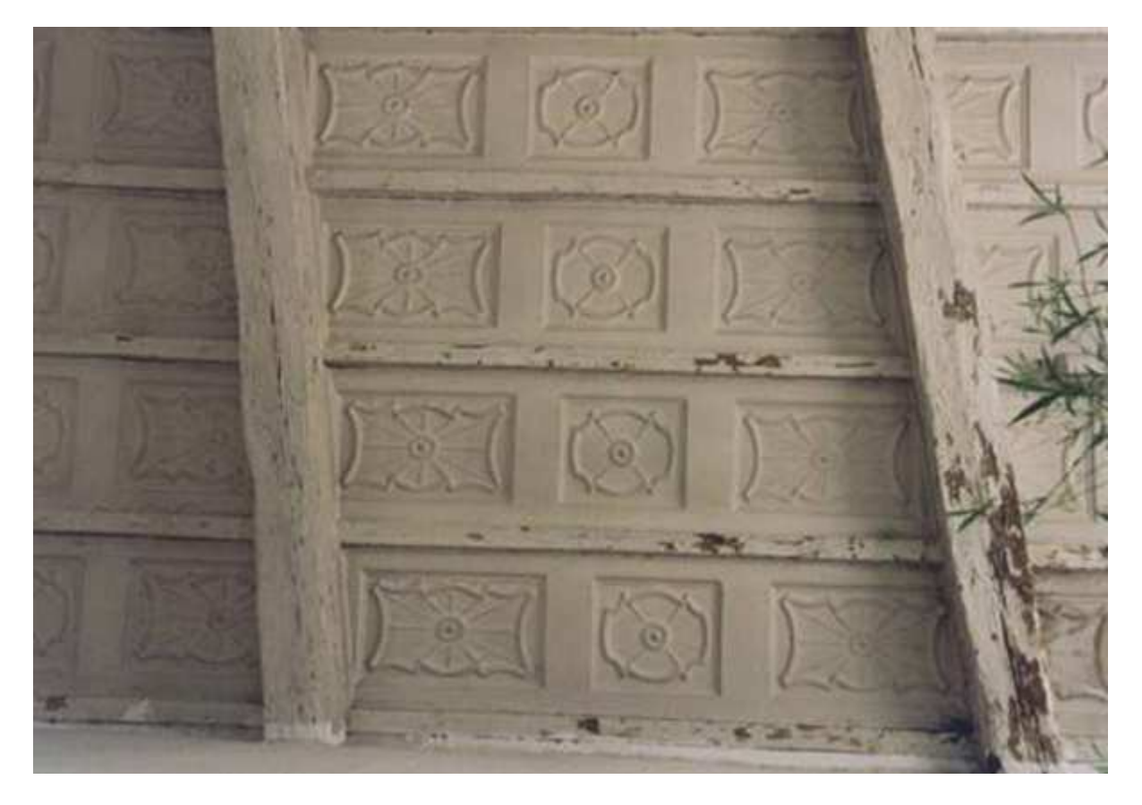
Gypsum ceiling type E

The gypsum boards bearing decorations in relief are geometrically defined by their many decorations and in relation to the latter are spread across a large area sub/regional level. It is precisely for this reason that this work was built on the use of both methods of investigation of detail, both on its study of the territory. Through the latter, such as Geographic Information Systems, we have investigated the phenomenon in context and historical area, in addition, the use of photography and photogrammetry have allowed a detailed analysis of the gypsum ceilings and wooden doors.