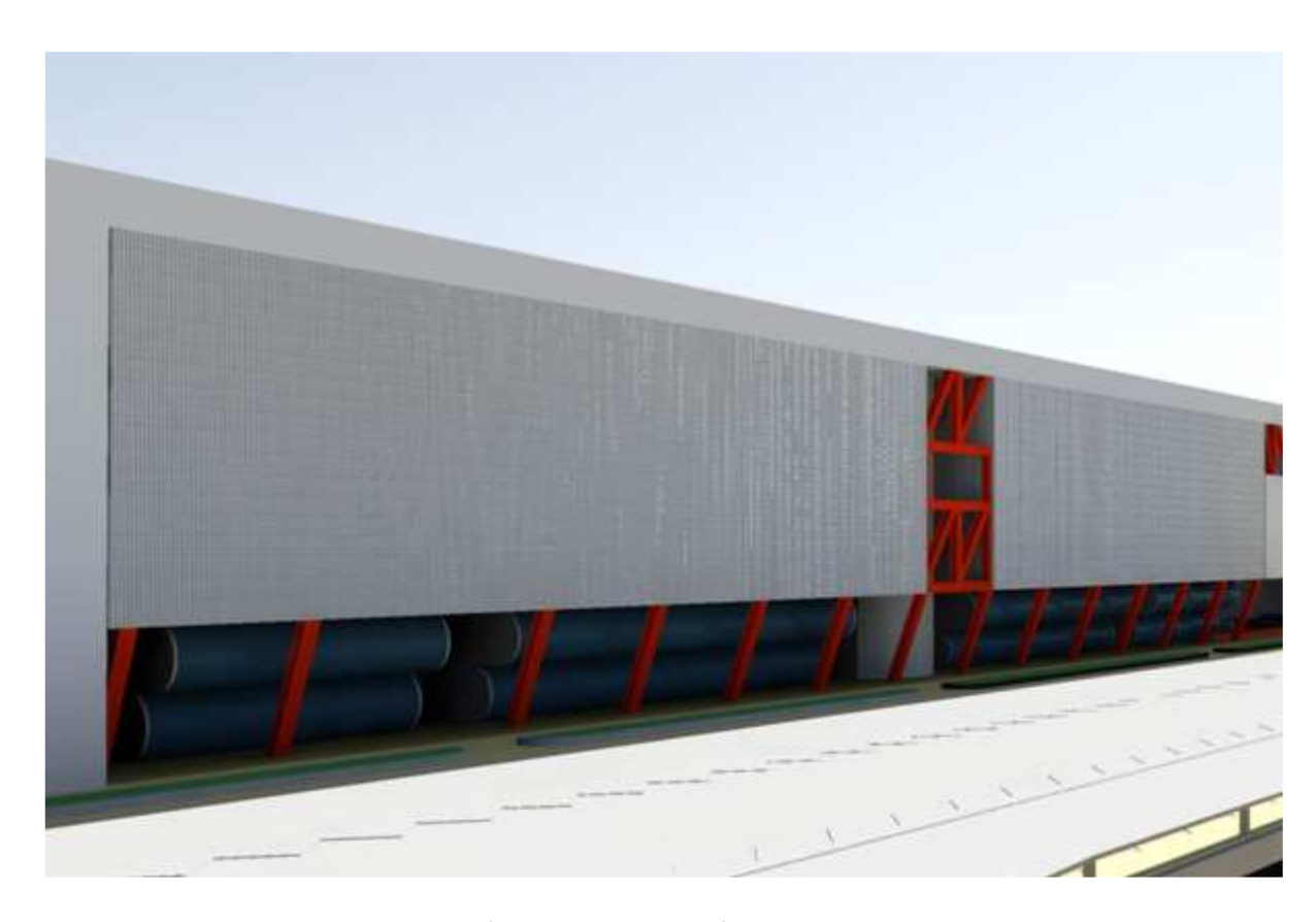
A view of the east side of the construction

The frame would support a considerable span of around fifty meters. As the TV tower, it would be only partially perceived by its users, but in its totality comprehended by people in cars driving across the main avenues. The external stairs which break the enormous length of the building are deliberately circular in shape as a reminiscence of simple columns or pilotis , an eye trick that softens its visual impact. They also give rhythm and liveliness to the complex and enhance its cultural character.