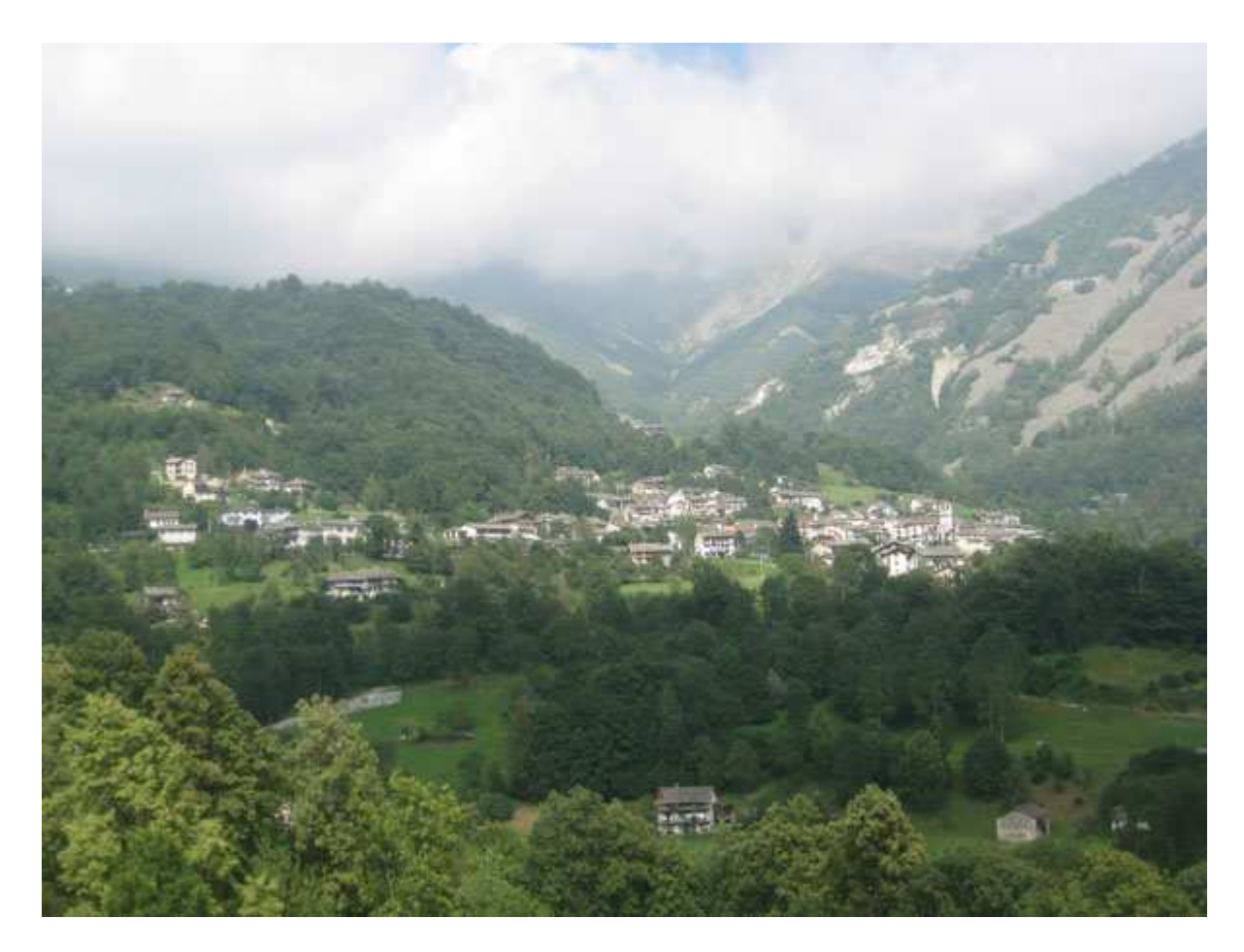
Overview of the town of Traversella

I chose to consider only these two municipalities, as for many other historical material has been destroyed during the Second World War or at least did not contain many useful documents for the purpose of my research.