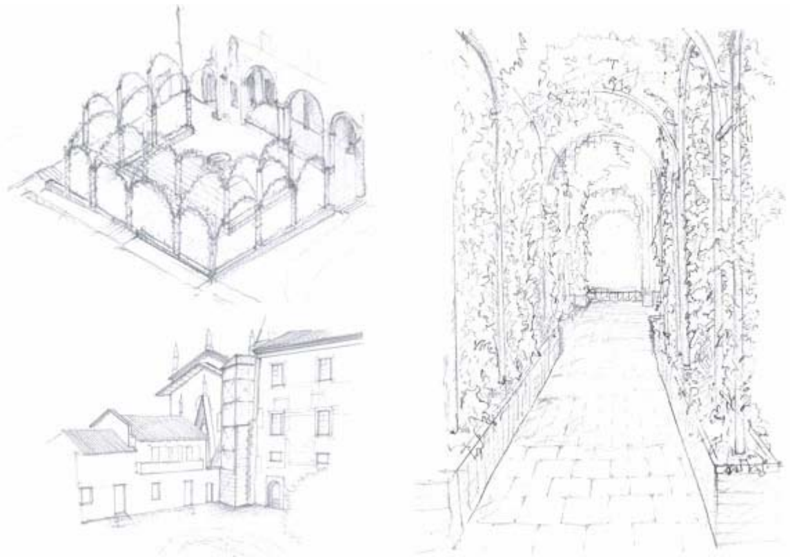
Sketches about "Monastery" project's ambit

In the "Ospedaletto"s ambit it's provided the introduction, after the hayloft's renovation, of local product's, as fruits and herbs, transformation activities; it's also provided the possibility to sell the products in the same place. In this area it will be also located a bookshop and a hall dedicated to school-children and groups. It will be recovered the entry by the ancient portal along the way called Strada Antica di Francia (now not possible because of the street's higher level); about energy systems, it has been suggested to insert a "photovoltaic roofing" along the inner side of party wall, and to use horizontal geothermal feeler.