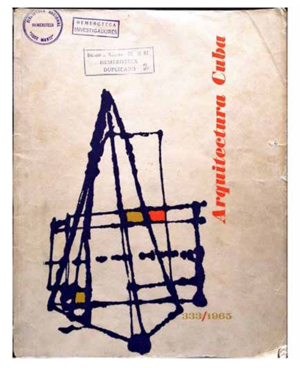
Cover of Arquitectura/Cuba n°333/1965

Extract from the "Census on Cuban architecture 1960 - 1990"