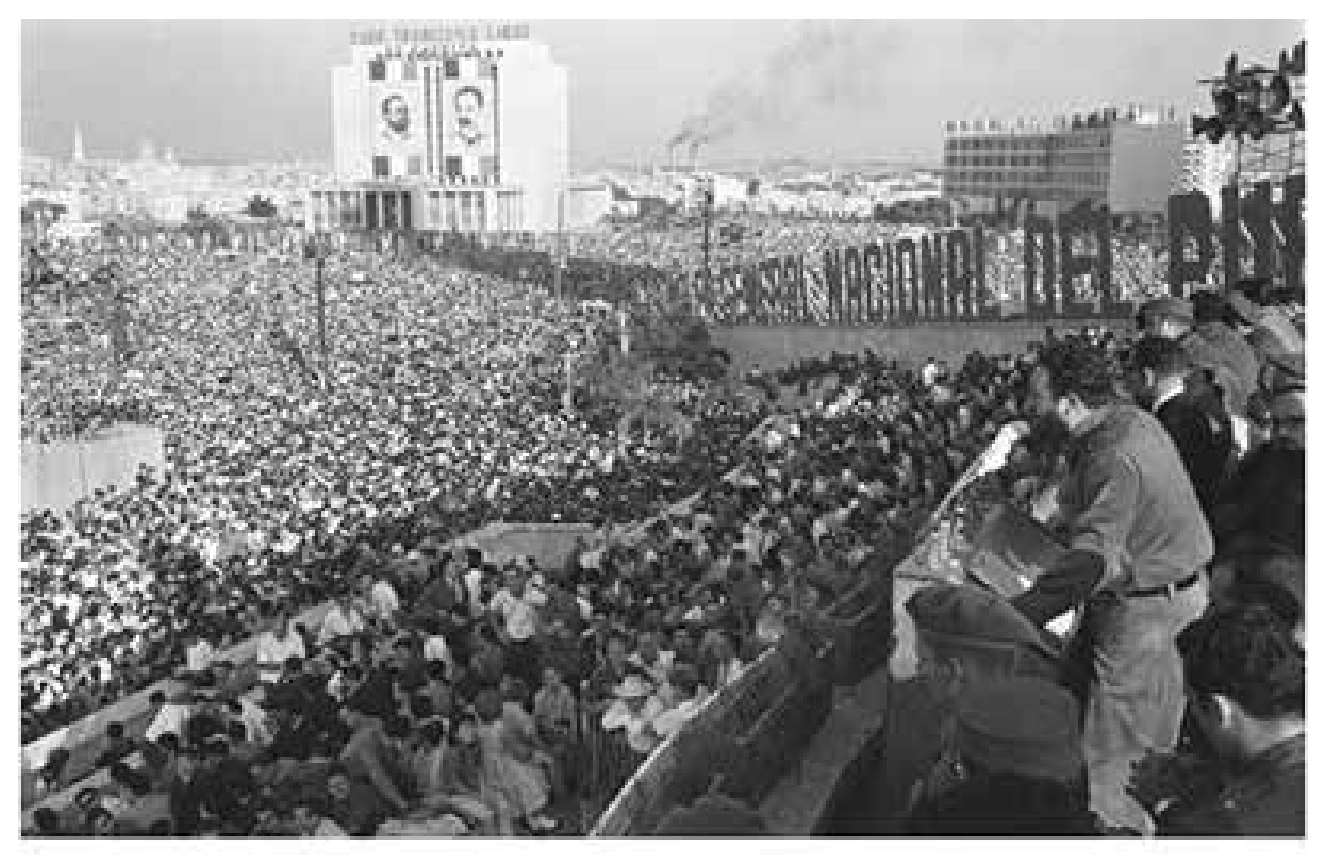
Fidel Castro speaks to the Cuban people in the Plaza de la Revolucion, 1962