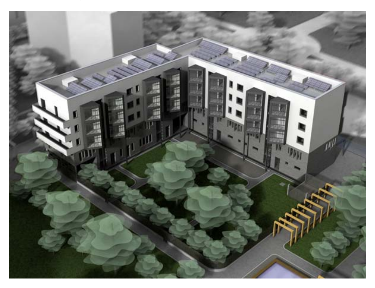
Standard building facing the park

Within the park there are a few one-floor buildings which house some services relating to the green areas: an eco-volunteers main office, two semi-covered resting areas and a bike-sharing centre. The park is divided into a more naturalistic wooden area towards the border with Avio, and a more designed intermediate area to conclude with the condominium private areas. The side on via Carignano consists of seven five-floor buildings, for a total area of 30.675 m² (four in private housing and three in social housing) which protects the park and its bicycle and pedestrian tracks from the driveway. In the southern part of the park there is a last two-floor building which houses a multifunctional centre. The residential buildings are linked by a covered shopping area which runs parallel to via Carignano.